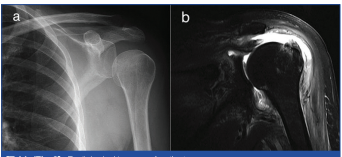
[Table/Fig-2]: Radiological images of patient. a) X-ray of left shoulder joint showing increased joint space; b) Magnetic resonance imaging short tau inversion recovery (STIR) coronal image of left shoulder joint showing oedema, debris along with heterogeneous signals in the joint.

b) Fluroscopic image showing dilated (15 mm) common bile duct, large (12 mm) filling defect in it with bilateral dilated intrahepatic biliary radicles.